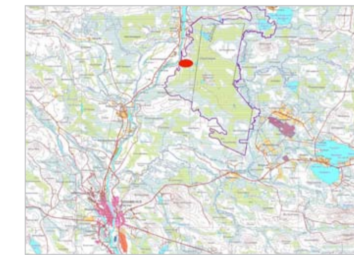
Figure 1: The location of the Sakatti marked by red circle. Location of Viiankiaapa Natura 2000 site marked by purple outline.